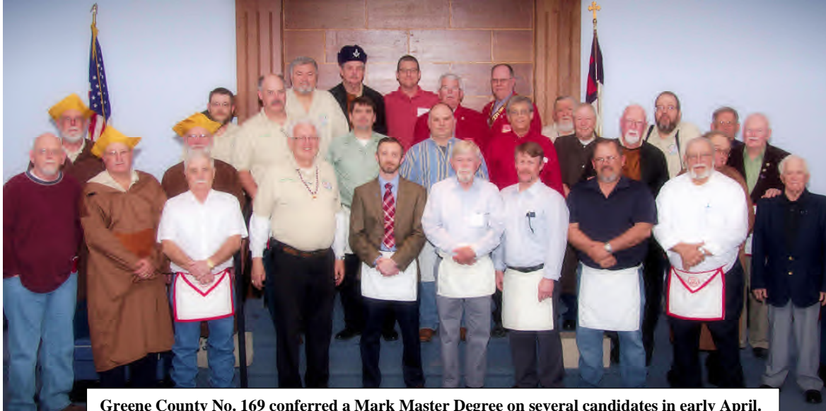
Greene County No. 169 conferred a Mark Master Degree on several candidates in early April.