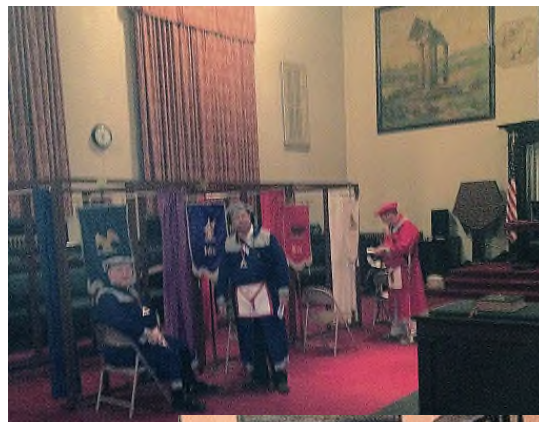
Preparing for and conferring the Royal Arch Degree at Clinton No. 82. Three Exalted on April 20 th , 2016.