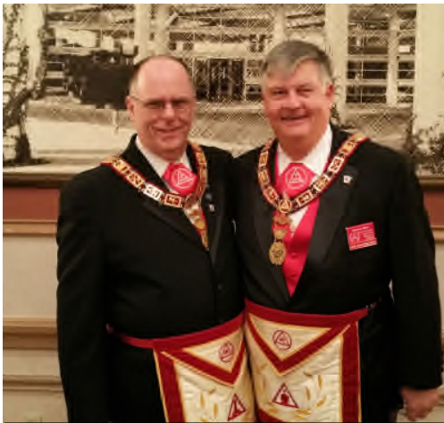
IN ..... OUT A Great Year Past ... a Great Year to Come!!