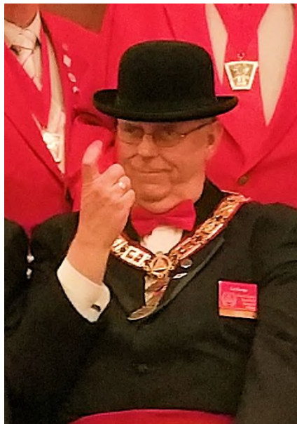
The Grand High Priest exercises his prerogatives.