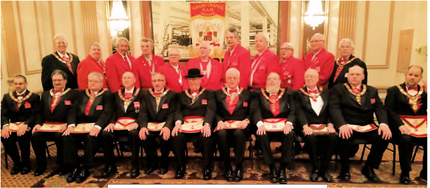
Your Indiana Grand Chapter Officers for 2016 – 2017!