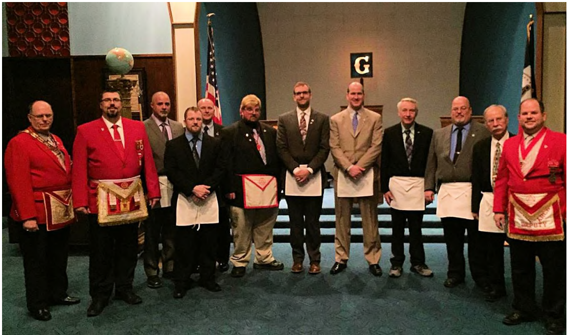
New Companions at Valparaiso No.79

MOST EXCELLENT & ROYAL ARCH DEGREES THURSDAY, JUNE 2 ND ... 6:00 PM EVANSVILLE NO. 12 301 CHESTNUT STREET ... EVANSVILLE