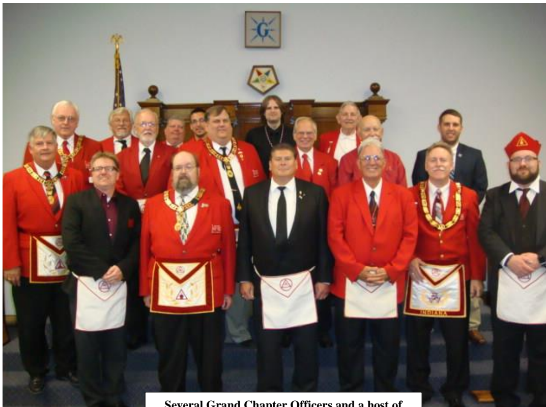
Several Grand Chapter Officers and a host of others gathered to help confer the Royal Arch Degree at Shelby No. 20 on July 21 st .