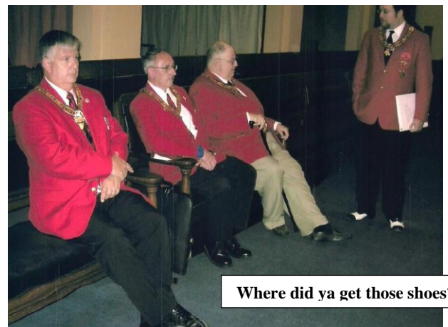
Where did ya get those shoes?