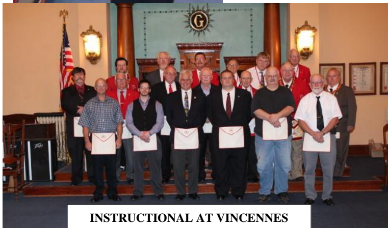
INSTRUCTIONAL AT VINCENNES