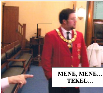
MENE, MENE... TEKEL...